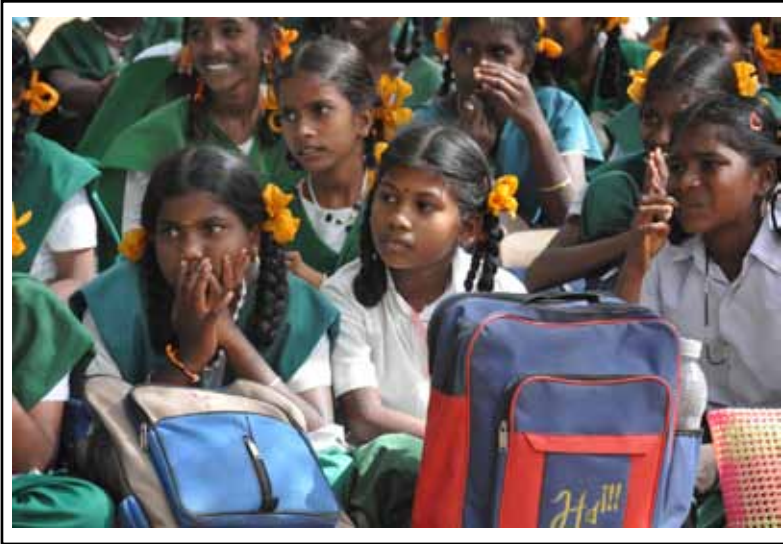
Children watching the cultural folklore performed by SCIENCE cultural group

The yatra started at the source of Vaigai River. A small hamlet called Varasanadu. Varasanadu hills are part of the Western Ghats. VASANTHAM and VAIGAI WOMEN FEDERATION collaborated with us in the day one programs.