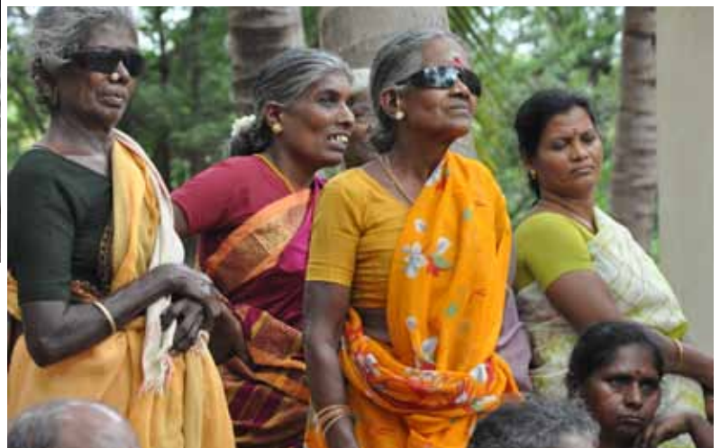
The Grand old ladies of Varusanadu listening keenly to the members of the yatra

Sit by a river. Find peace and meaning In the rhythm Of the lifeblood of the Earth