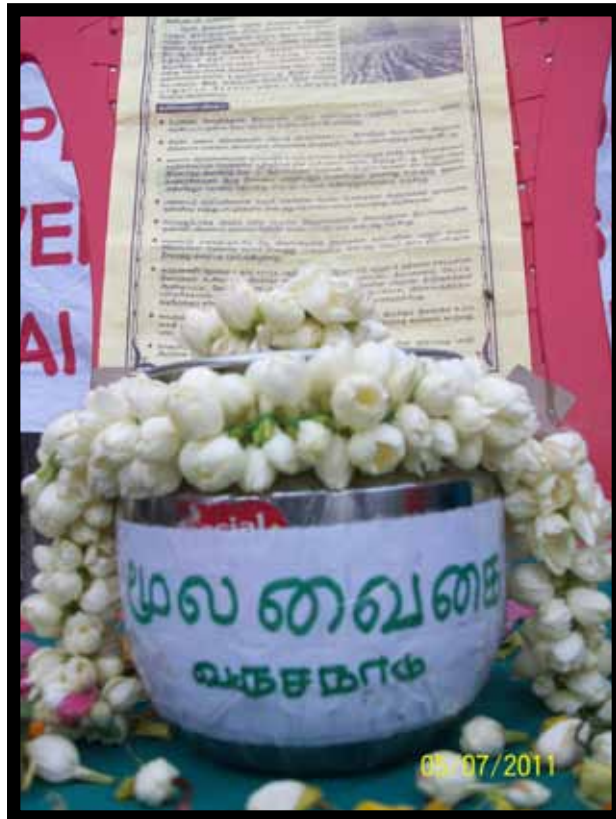
The water collected from the source of Vaigai in Varusanadu