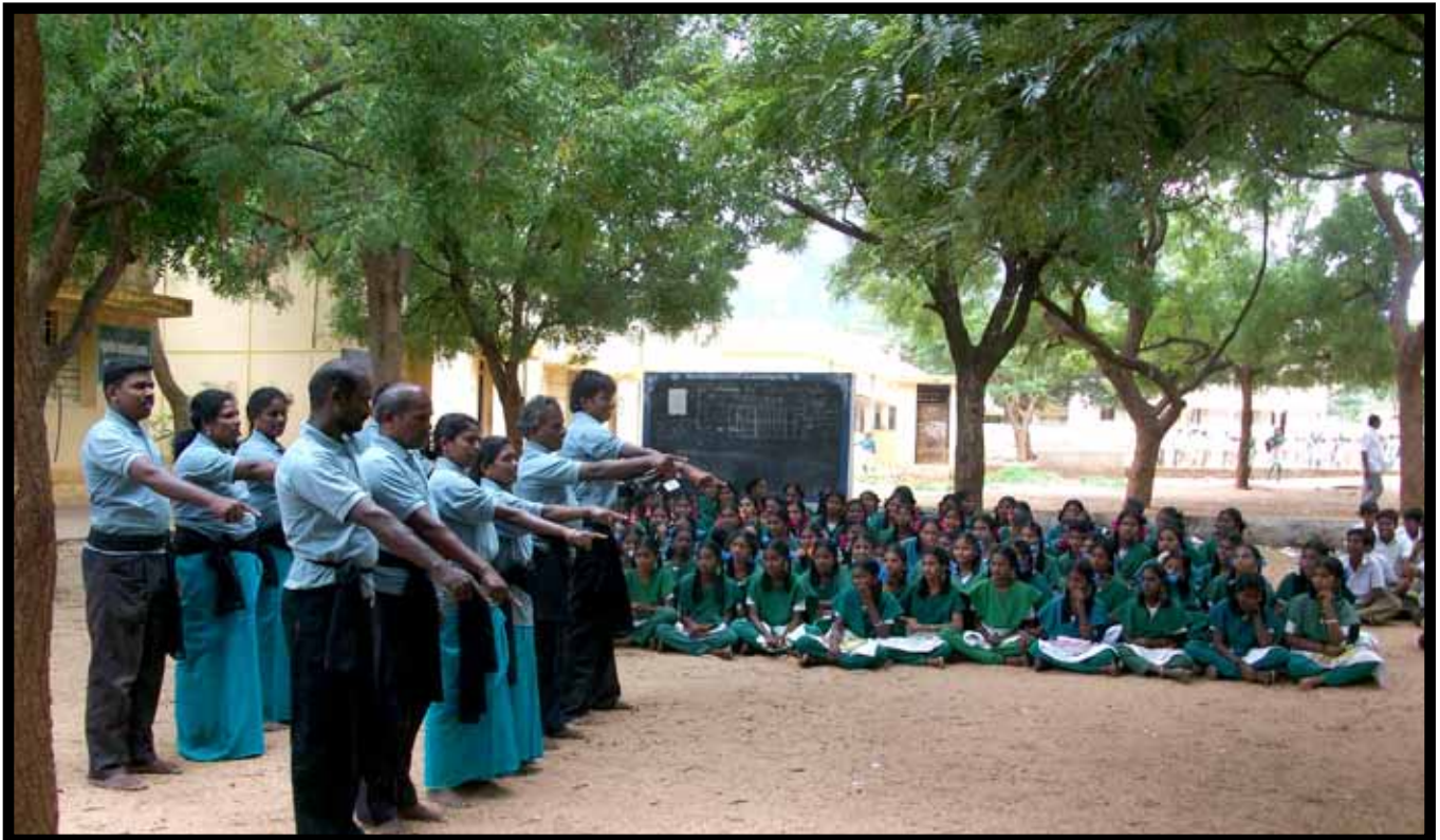
A Pledge to protect River Vaigai and the natural Resources