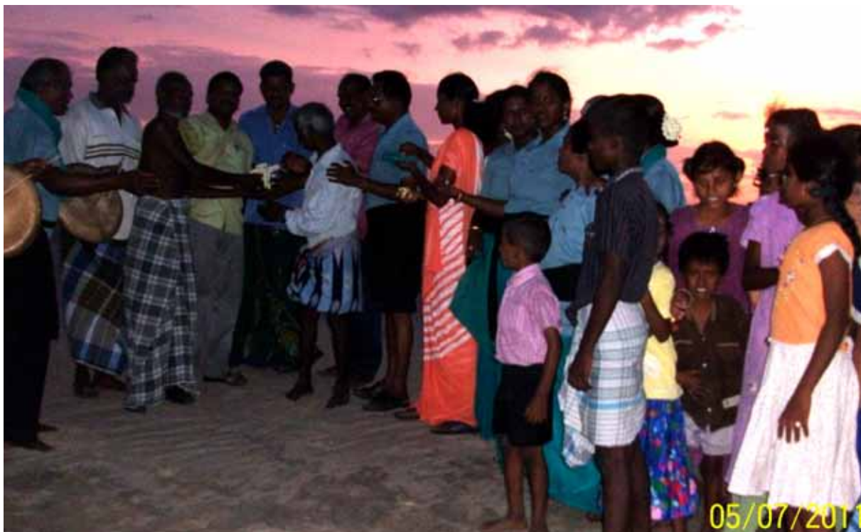
Being handed over to the elders of the elders of the fisher folk village at the mouth of the river